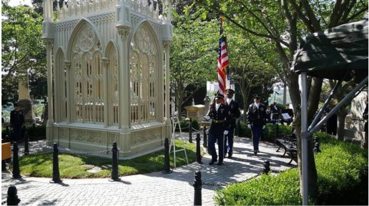
US Army Color Guard advances the Colors at President Monroe's tomb