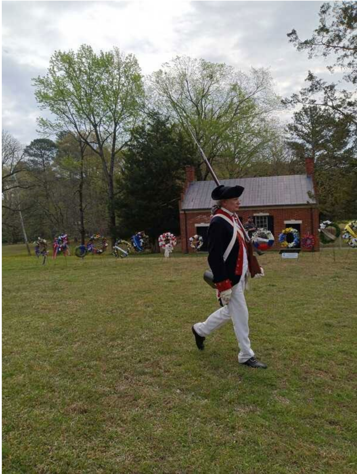
April 10th, 2022, Sunday (3:00 pm) – Multiple Patriot Grave Marking Event Level: Chapter