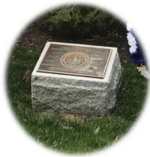
Memorial to the Lexington Militia at Arlington National Cemetery