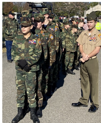
Seymour (Indiana) Chapter of the Young Marines.