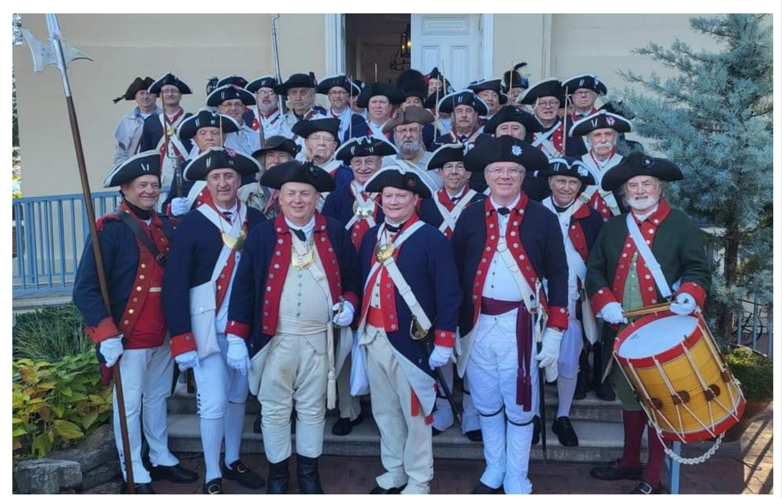
NSSAR Color Guard