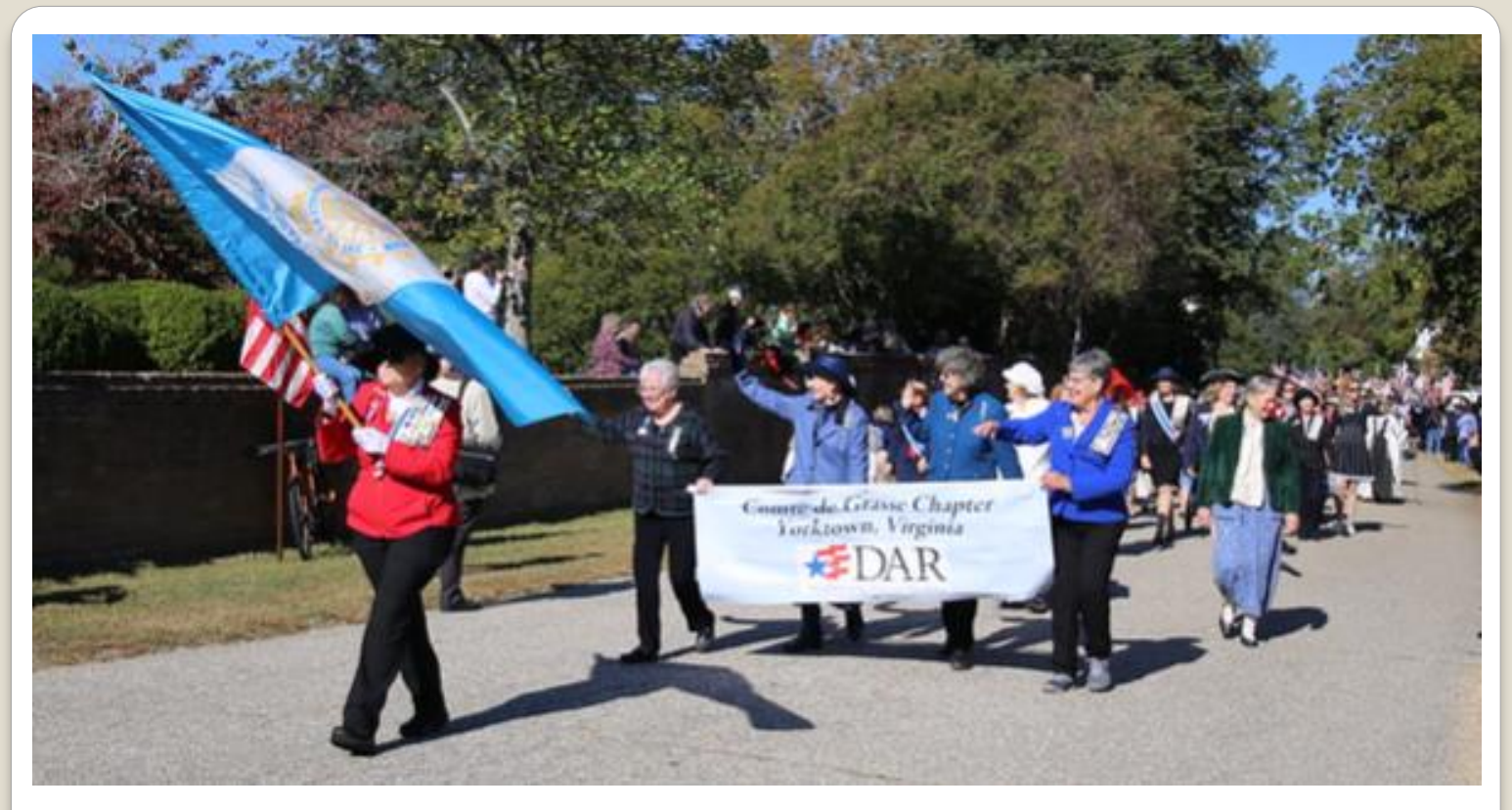
Daughters of the American Revolution