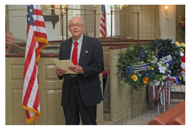
Williamsburg Mayor Clyde Haulman brought greetings from the City of Williamsburg