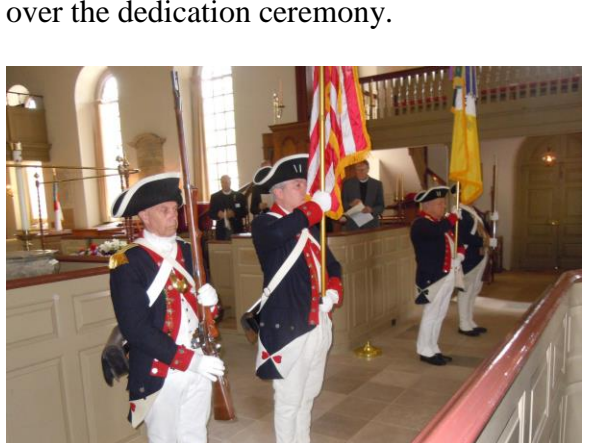
The VASSAR Color Guard