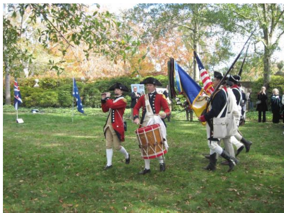
Colonial Williamsburg Fife and Drummer and our Color Guard

General George Washington addressing the visitors at the cemetery with Williamsburg Chapter color guard in the background.