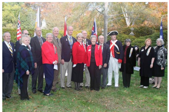
SAR and DAR members at the ceremony