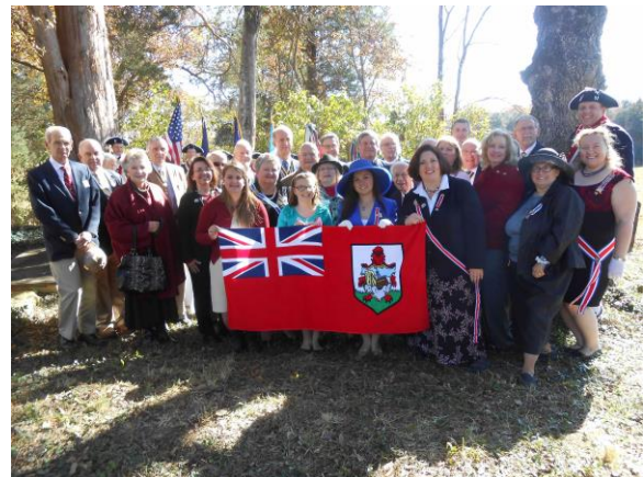
SAR, DAR & CAR Attendees

There will be a grave marking in May at the Congressional Cemetery in Washington, D.C. for Thomas Tucker and a wreath laying ceremony for St. George Tucker in Williamsburg probably in October. A commemoration in Bermuda for the brothers is being planned for 2015.