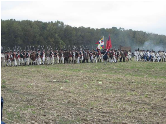
Re-enactors at Warner Hall

Those who attended the Battle of the Hook Reenactment after the Yorktown Day morning ceremonies were treated with the scene of approximately 1,500 re-enactors doing battle at Warner Hall in Gloucester County.