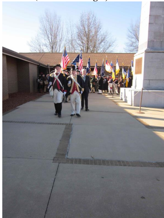
March to the Monument