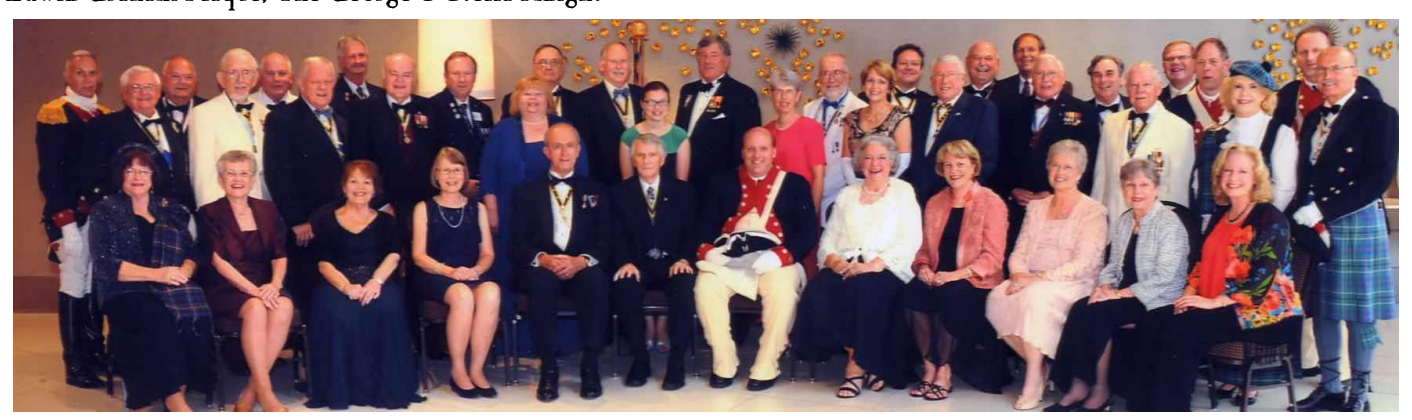
Group photo of the VASSAR attendees.

All in all the Congress was a great experience for all of our folks from VASSAR.