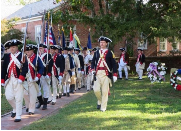
SAR Officers and Color Guard. Wreath laying ceremony at the grave of Governor Thomas Nelson Jr.