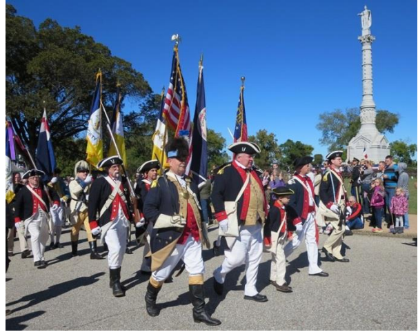
Sons of the American Revolution Parading in front of the Monument.