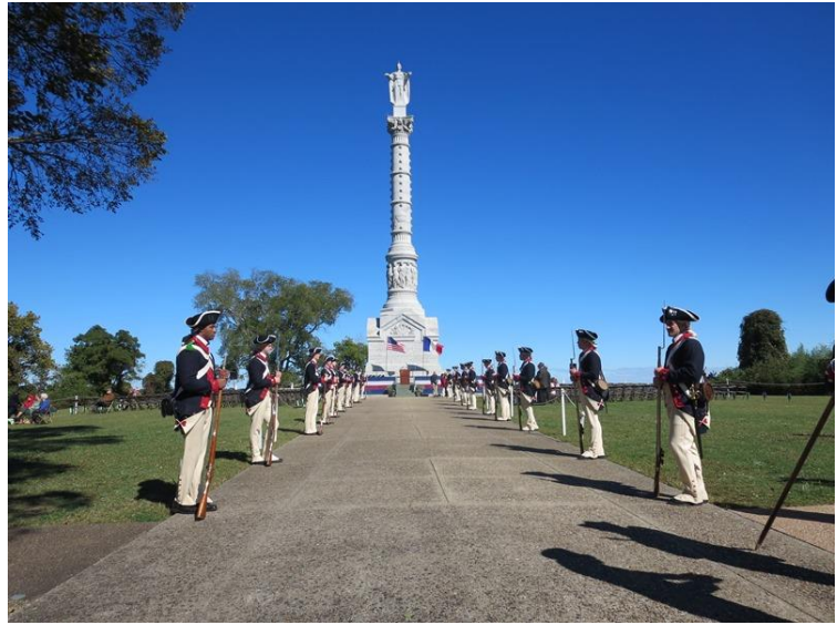
The Yorktown Monument.