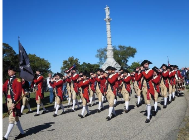
Colonial Williamsburg Fife and Drum Corps on Parade.