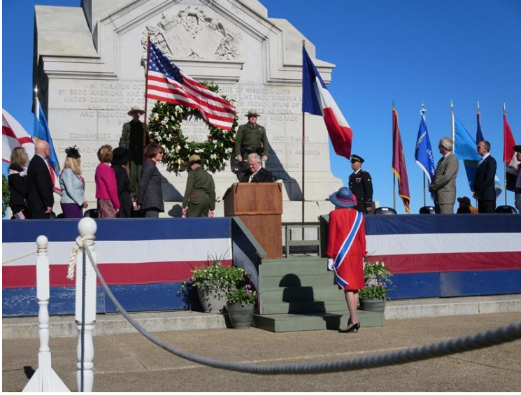
Wreath laying on the Yorktown Monument.