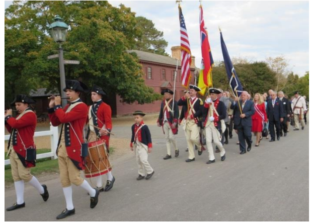
The parade underway.