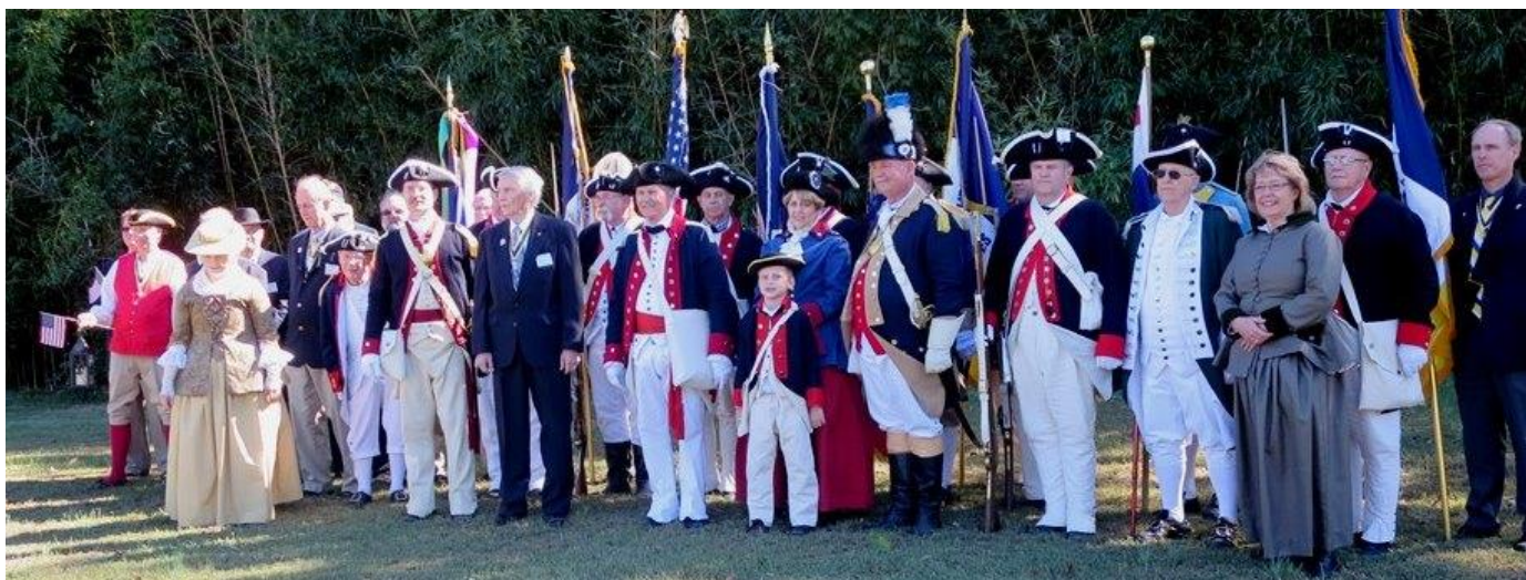
SAR group photo after the Parade.