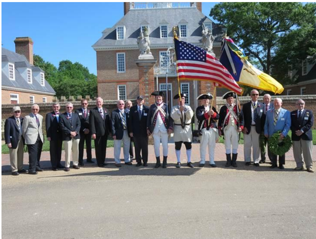
SAR members and Color Guard at Memorial Day ceremony.