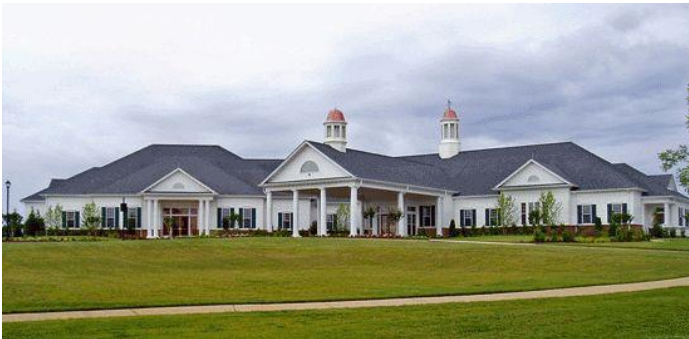
The Clubhouse at Colonial Heritage

Beginning with our luncheon meeting on Saturday, February 18, 2017, the Williamsburg Chapter SAR will be meeting at The Colonial Heritage Club , 6500 Arthur Hills Drive, Williamsburg, VA 23188. This change in venue has many positives going forward. Our luncheon room is the Heritage Dining Room, the main dining room for the Colonial Heritage neighborhood. It is large enough to accommodate our group comfortably. It has two walls of windows which gives it a nice open feel and the room opens to a covered porch which overlooks the putting green. Our menu will include 4 options; a regular menu (not always chicken), a vegan option, a vegetarian option and a gluten free option. All menu options come with side salad, dessert, warm rolls, coffee, tea, and water. The cost remains at $20. There will be a cash bar available prior to the meal.