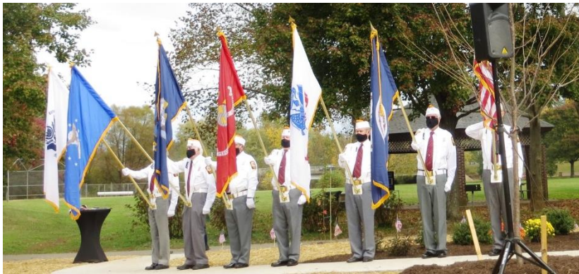
Grand Union Flag on left and Culpeper Minutemen flag on right.

The Minutemen monument situated next to Virginia's first Charters of Freedom display containing replica, bronze, engraved copies of the Declaration of Independence, Bill of Rights and U.S. Constitution.