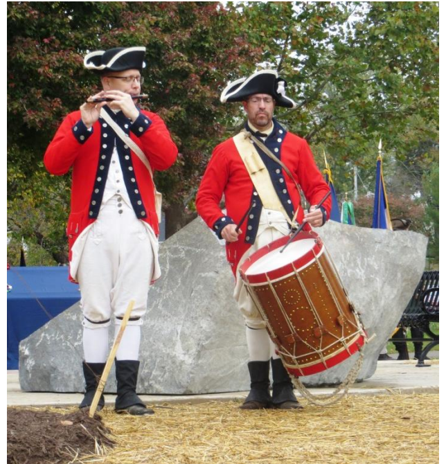
The Fife and Drum of the Culpeper Minute Men Chapter

The Minutemen monument situated next to Virginia's first Charters of Freedom display containing replica, bronze, engraved copies of the Declaration of Independence, Bill of Rights and U.S. Constitution.