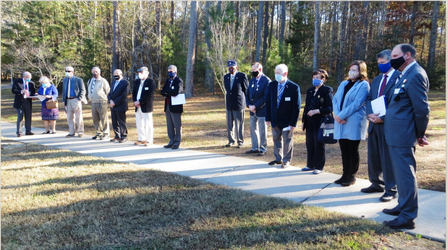
Participants during our New member Induction and Awards ceremony at Freedom Park on Nov 20, 2020.