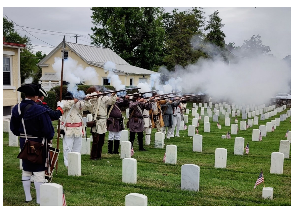
VASSAR Color Guard Musket Volley.